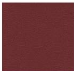
PRINCIPAL PLUS RUST