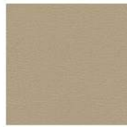
PRINCIPAL PLUS LATTE