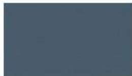
STUDIO ENCORE WEDGEWOOD