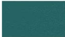
STUDIO ENCORE SEAGRASS