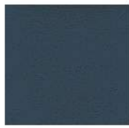
PRINCIPAL PLUS INK