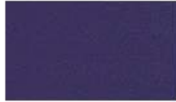
STUDIO ENCORE REGAL