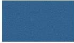
STUDIO ENCORE PERIWINKLE