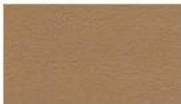
STUDIO ENCORE TOBACCO