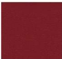
PRINCIPAL PLUS RED