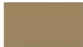
STUDIO ENCORE NOUGAT