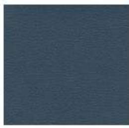
PRINCIPAL PLUS INDIGO