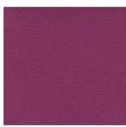
PRINCIPAL PLUS MAGENTA