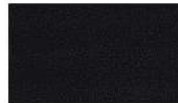
STUDIO ENCORE BLACK