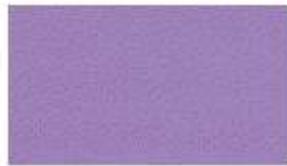
STUDIO ENCORE LILAC