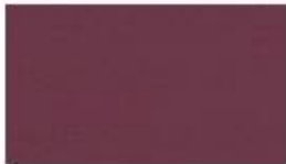
STUDIO ENCORE RUBY