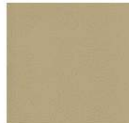
PRINCIPAL PLUS DUNE