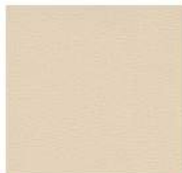
PRINCIPAL PLUS CHAI