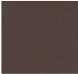
PRINCIPAL PLUS EXPRESSO