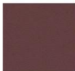
PRINCIPAL PLUS CHERRYWOOD