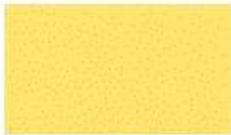
STUDIO ENCORE LEMON TWIST