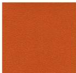
PRINCIPAL PLUS TANGERINE