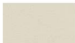
STUDIO ENCORE CHALK