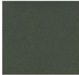
PRINCIPAL PLUS FERN