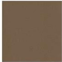
PRINCIPAL PLUS FUDGE