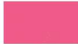
STUDIO ENCORE LIPSTICK