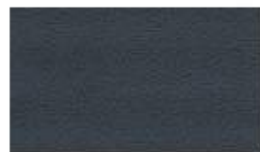
STUDIO ENCORE NAVY