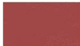
STUDIO ENCORE CAMEO