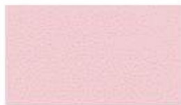
STUDIO ENCORE MINK