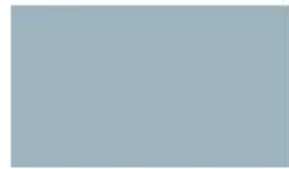
STUDIO ENCORE ICEBERG