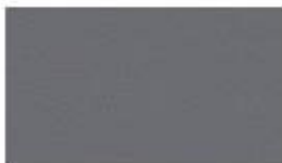
STUDIO ENCORE SMOKE