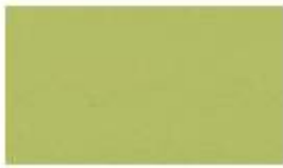
STUDIO ENCORE CITRONELLE