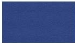
STUDIO ENCORE ATLANTIC