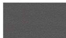
STUDIO ENCORE CHARCOAL