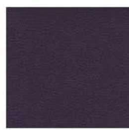
PRINCIPAL PLUS PASSION