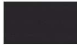
STUDIO ENCORE COFFEE BEAN