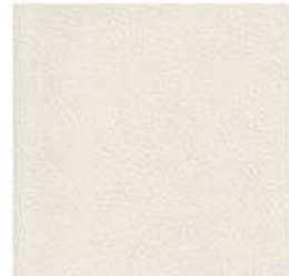
PRINCIPAL PLUS SNOW