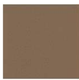
PRINCIPAL PLUS MOCHA