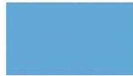
STUDIO ENCORE LAGOON